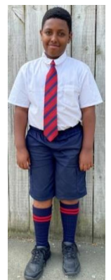
Year 7 & 8 Boys

As the sun can be fierce in Term 1, all ākongā are to wear a sunhat when outside. Please check your tamariki has a hat each day. Sunscreen may also be of benefit at this time.