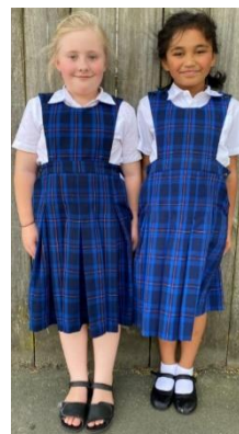
Year 1-6 Girls

Summer has arrived. Ākongā wear a summer uniform in Term 1. We encourage all ākongā to wear their uniform with pride.