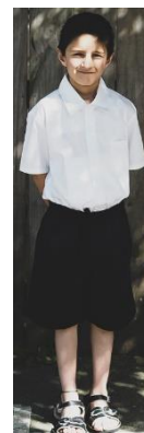
Year 1-6 Boys