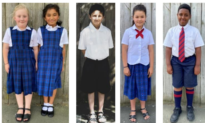
Year 1-6 Girls

Summer has arrived. Ākonga wear a summer uniform in Term 1. We encourage all ākonga to wear their uniform with pride.